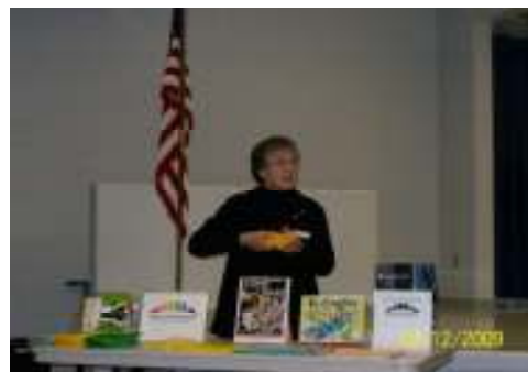
Photos from the Winter General Meeting